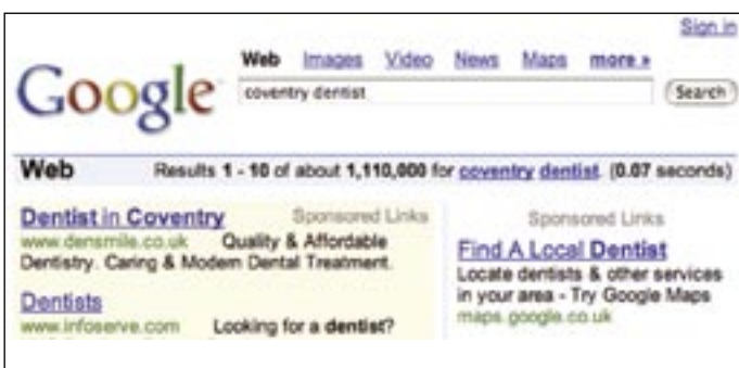
Figure 4c: Google Pay-Per-Click (PPC) advertising

The wording on PPC sponsored adverts on Google.co.uk should be thoughtfully chosen and, if possible, address affordability. Improving the wording on PPC adverts will improve the Click-Through-Rate (CTR) regardless of the actual ranking; a sponsored advert will attract more clicks if the wording is relevant to the search. 'Quality & Affordable Dentistry' are the words used by www.densmile.co.uk to attract patients looking for a general 'coventry dentist'.