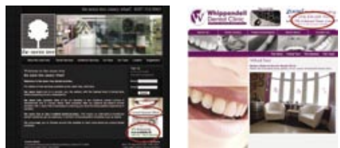
Figures 5a and 5b: Affordability Awareness

The information displayed on a high ranking web portal to advertise www.basrai.co.uk clearly explains the USPs of the cosmetic dental practice, in Grays, Essex, what it can offer and addresses affordability. The effects of such a featured page with links to www.basrai.co.uk is (1) increased visitors and (2) improved search engine ranking for Dr Basrai's website. The web page on a different high-ranking web directory is also optimised for the Grays, Essex, location as well as dental key phrases and thus helps with Dr Basrai's own website's ranking.