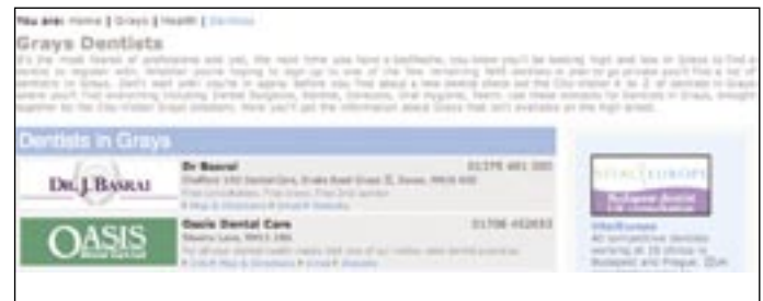
Figures 4a and b: Web Portal Content

The information displayed on a high ranking web portal to advertise www.basrai.co.uk clearly explains the USPs of the cosmetic dental practice, in Grays, Essex, what it can offer and addresses affordability. The effects of such a featured page with links to www.basrai.co.uk is (1) increased visitors and (2) improved search engine ranking for Dr Basrai's website. The web page on a different high-ranking web directory is also optimised for the Grays, Essex, location as well as dental key phrases and thus helps with Dr Basrai's own website's ranking.